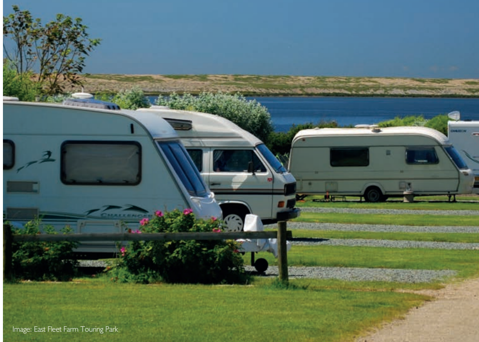
Image: East Fleet Farm Touring Park

Enjoy your holiday Choose a Best of British Park!